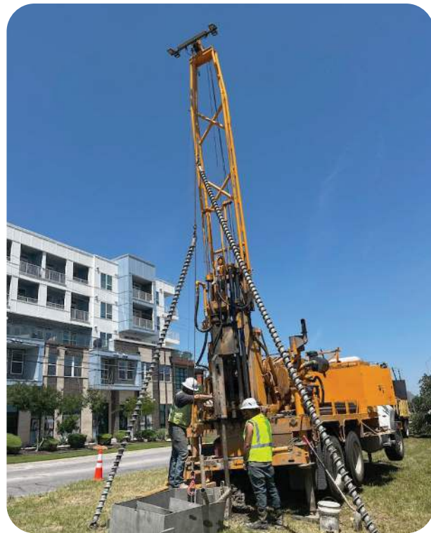
Field investigation activity along the light rail alignment

KAP will lead the design and construction of the Operations and Maintenance Facility, where Austin's light rail vehicles will be stored, serviced and dispatched. The facility will also serve as a workplace for operators, maintenance crews and support staff who will keep the system running safely and efficiently.