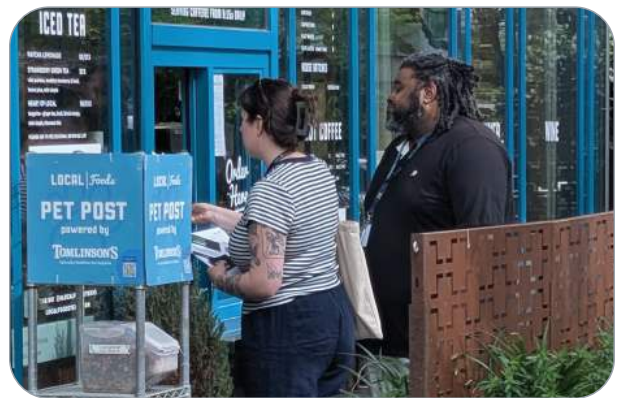
ATP team conducting block walking to support businesses along the light rail alignment

From April to June, ATP conducted block walking to meet individual businesses along the light rail alignment. The goal of the outreach was to engage directly with every business to confirm each business’s location, share information about the project, distribute a survey, and collect contact information. This feedback will be used to identify priorities and business needs that are specific to Austin and help inform our efforts to support businesses during future construction. An implementation plan will be developed this year, informed by the needs assessment findings and peer benchmarking.