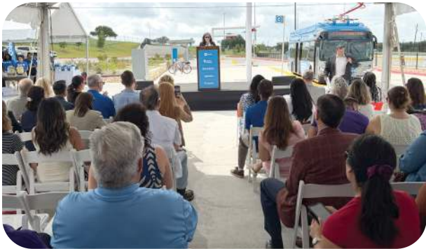
Launch of new Rapid lines, and Expo Center and Goodnight Ranch Park & Rides

On Sunday June 7th, CapMetro opened the new Goodnight Ranch and Expo Center park-and-ride facilities and fully launched the Rapid 800 and Rapid 837, operating at a 10-minute frequency during peak hours.