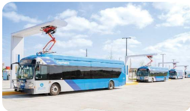
The new Goodnight Ranch Park & Ride facility

The Goodnight Ranch Park & Ride , located in southeast Austin at the end of Rapid 800 Pleasant Valley Rapid line, has 64 customer parking spaces, four bus bays with overhead electric bus charging stations, a shelter with upgraded lighting and security features such as cameras, sidewalks and pedestrian safety improvements, and landscaping and irrigation improvements. Route 318 and Route 333 now end at Goodnight Ranch as part of the service change.