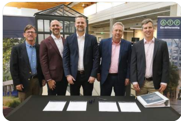
ATP and KAP leadership