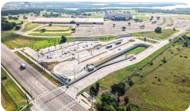
The new Expo Center Park & Ride facility

The Expo Center Park & Ride , located in northeast Austin at the end of Rapid 837 Expo Center Rapid line, has 159 customer parking spaces and eight bus bays with overhead electric bus charging stations, along with safety improvements. Routes 18, 233 and 337 also serve the Expo Center Park & Ride as part of this change.