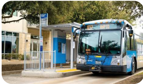
The newly launched Rapid 837 CapMetro bus

The Goodnight Ranch Park & Ride , located in southeast Austin at the end of Rapid 800 Pleasant Valley Rapid line, has 64 customer parking spaces, four bus bays with overhead electric bus charging stations, a shelter with upgraded lighting and security features such as cameras, sidewalks and pedestrian safety improvements, and landscaping and irrigation improvements. Route 318 and Route 333 now end at Goodnight Ranch as part of the service change.