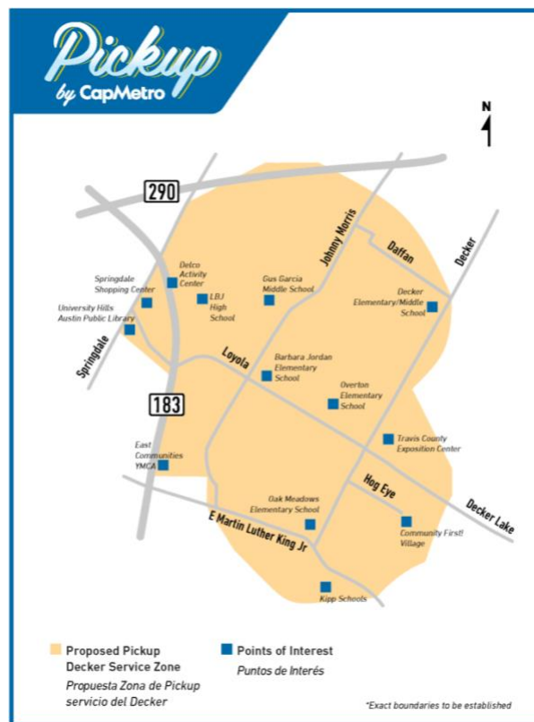
Proposed Pickup zone in Decker

The Park & Rides at Goodnight Ranch and Expo Center will support the upcoming CapMetro Rapid lines. These new locations will offer ample parking for commuters with connections to local routes and feature end-of-line charging for CapMetro's zero-emission bus fleet.