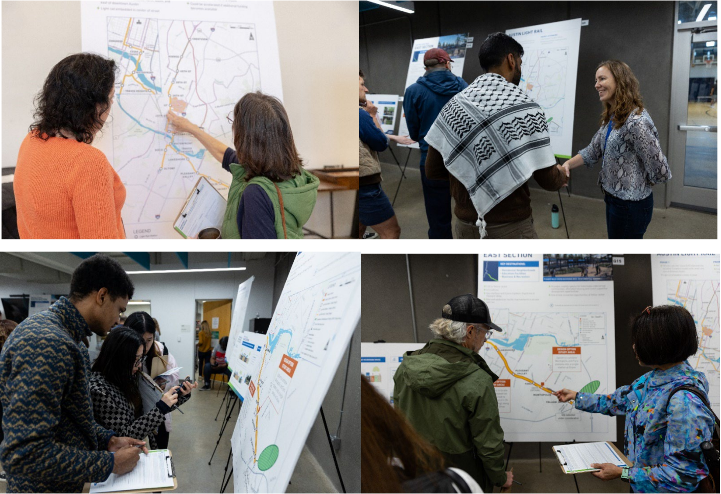
Community engages with ATP staff at February Open Houses