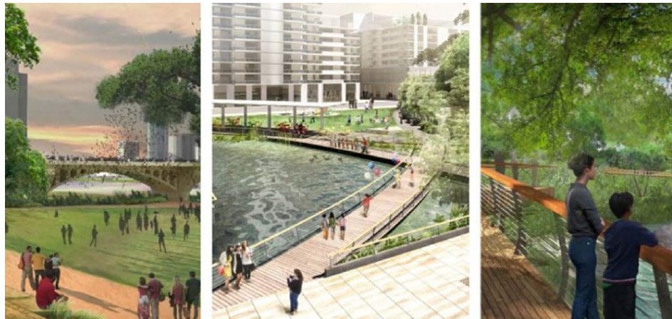
Renderings of South Central Waterfront District

There will be a community meeting for residents to learn more about the South Central Waterfront District coming soon.