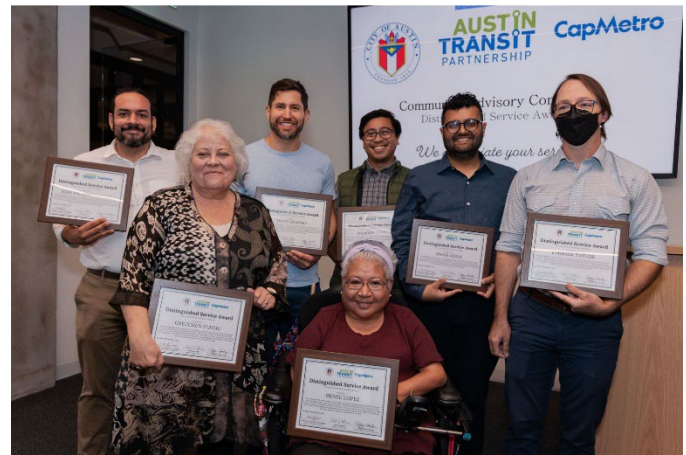
CAC Distinguished Service Award recipients present on December 1