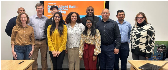
ATP leadership meets with University of Texas at Austin students

Collaboration with Austin’s educational institutions is one of many partnerships that helps inform how Austin Light Rail will serve the community. This fall, ATP partnered with the University of Austin at Texas to mentor College of Engineering and the School of Design and Creative Technologies students. Students analyzed aspects of the project, and ATP staff gained diverse perspectives into their Austin Light Rail work. ATP staff served as the “client” for students tasked with developing creative solutions to design, such as connecting the proposed light rail bridge to the trail system at the north shore of Lady Bird Lake as well as optimizing wayfinding and access for campus transit users.