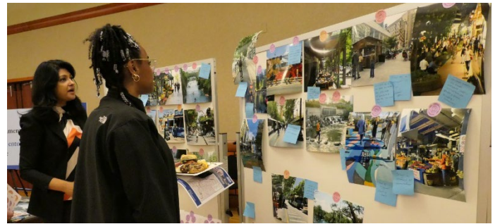
University of Texas User Experience Open | November 16, 2023

From November through December, ATP hosted five open houses with more than 300 attendees to learn how people use transit in Austin and explore design challenges related to safety, predictability, and comfort of light rail and the larger public transit system. This information will also be presented in a virtual meeting on December 13, and through an online survey until January 2. Data will inform the design process to help build a transit system that prioritizes people and their experiences and ultimately encourages more people to ride.