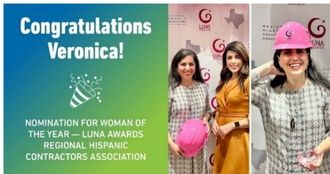
Hispanic Contractors Association Luna Awards | October 2023