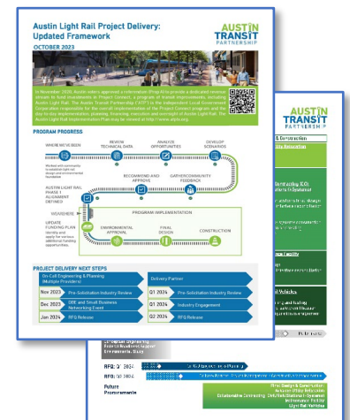
Project Delivery Framework | October 2023

Following extensive peer and industry engagement, ATP developed a contracting framework that spans all phases of the project. Staff identified near-term procurements including On-Call Planning and Engineering support services and a Delivery Partner to support project management, construction management, and more. ATP will share contracting opportunities and procurement next steps through a range of engagement opportunities, including events to support Disadvantaged Business Enterprise (DBE) Program, and local and small businesses. See the updated project delivery framework, vendor registration opportunities, and next steps on ATP's Industry Partners webpage .