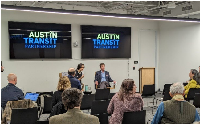
(Pictured: Feb. 15 Community Forum at ATP Headquarters)