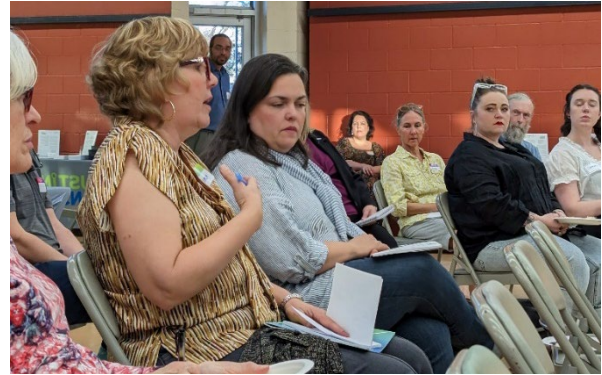
(Pictured: Community member raises a question during Feb. 22 Community Forum held at Mendez Recreation Center)