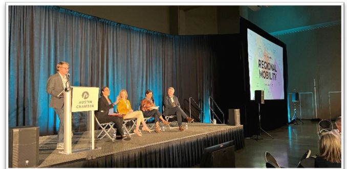
Austin Light Rail panel at the Regional Mobility Summit on April 12

ATP also discussed its partnership with Workforce Solutions to ready a mobility workforce for construction and operation of the system and announced its Industry Expo May 25, 2023.