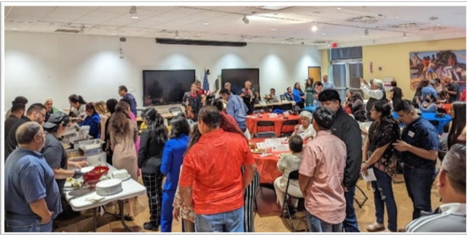
ATP attending League of United Latin American Citizens (LULAC) meeting

The ATP team continues engaging with the community and listening to the diverse range of feedback related to light rail options as part of the ongoing community dialogue period. Since the period kicked off March 21, ATP has held over 50 stakeholder meetings with more than 30 additional meetings planned for the remainder of the engagement period. Meetings include local