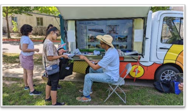
Austinites meet the 'MEEP' (Mobile Engagement and Event Pop-up) at the North Austin YMCA (Rundberg) on Apr. 25.

In April, Austin Transit Partnership was mentioned in 110 media stories.