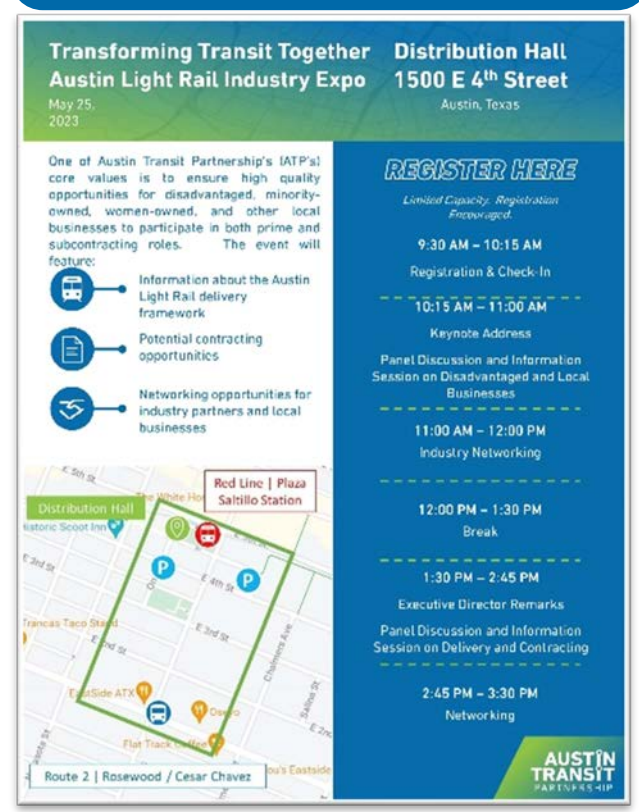
Austin Light Rail Industry Expo Invitation, May 25

203 Colorado St. | Austin, Texas 78701 || 512.389.7590 || atptx.org || @atp_org