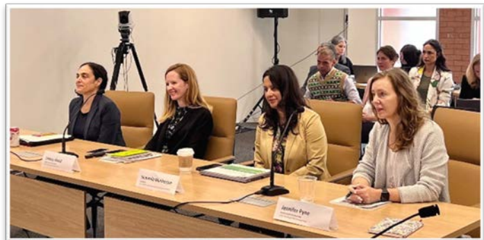
On May 8, the talented team of experts across City of Austin, CapMetro and ATP combined their technical excellence to present the light rail options to the ATP Board at a Work Session.