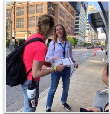
ATP staff chats up bus riders around town

ATP representatives and partners are attending stakeholder meetings, neighborhood association meetings, City of Austin Boards and Commissions and other community locations to talk about light rail. A combined outreach effort with CapMetro and City of Austin staff is underway to conduct outreach at bus stops around the city to talk with people using transit. As of April 7 th , the team has been to 31 stops .