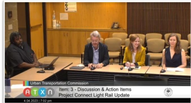
An ATP team presents to City Mobility Committee on 4/6