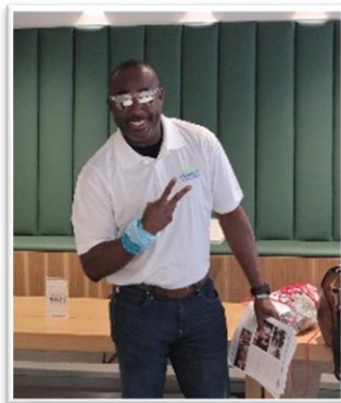
ATP staff heads out to bus stops to talk with transit riders about light rail