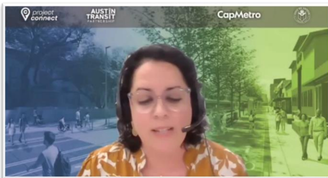
ATP staff hosts virtual light rail update in Spanish on 4/6