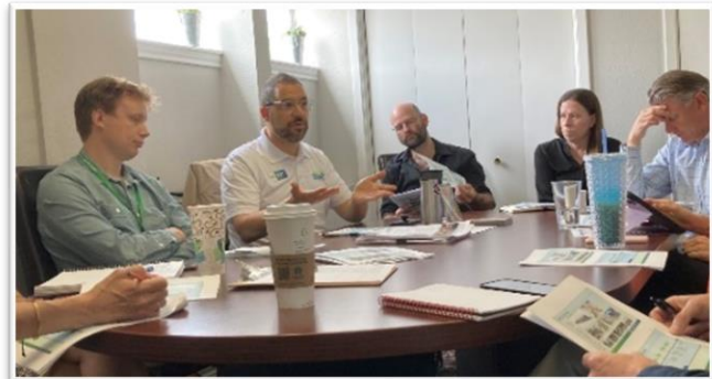
The team conducts stakeholder meetings, roundtables and one-on-one chats about the project