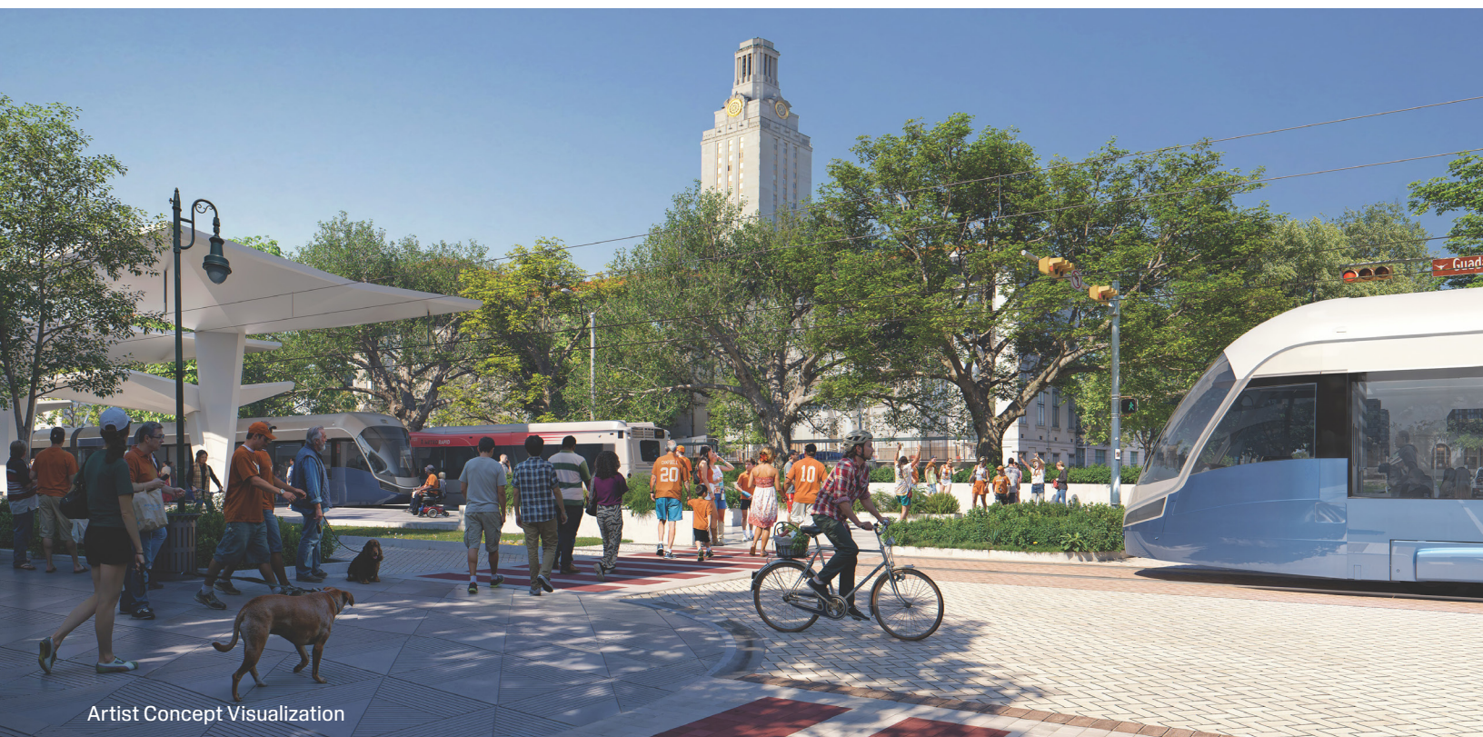
Artist Concept Visualization