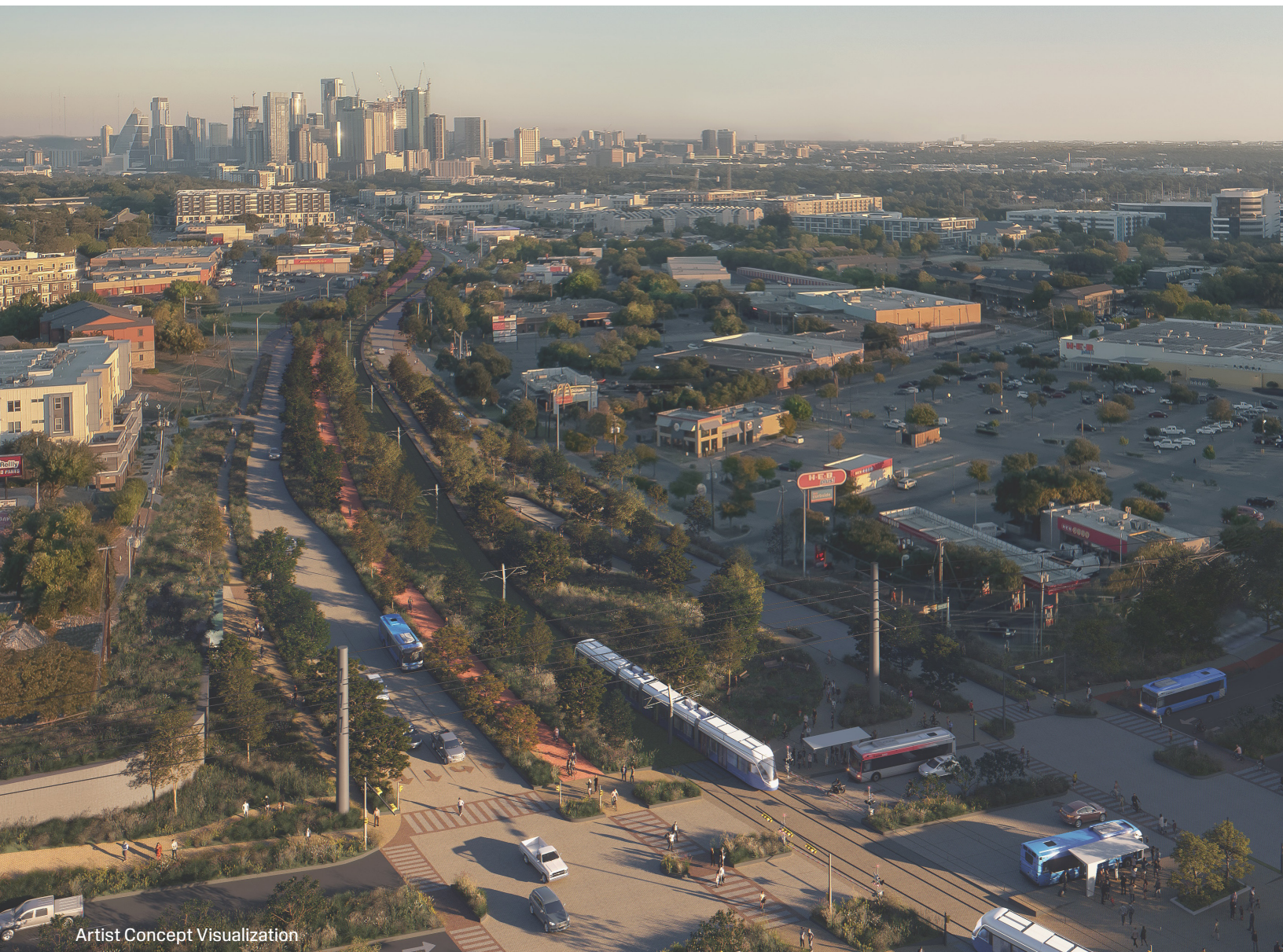
Artist Concept Visualization

ATP reserves all its rights with respect to this RFI. No respondent will have any rights against ATP arising from the contents of this RFI, any related one-on-one meetings, or the receipt of information in any feedback or meetings. ATP makes no representations, warranties, or guarantees that the information contained in this RFI or any other documents, or any addenda hereto, is accurate, complete, or timely. Furthermore, no such representations, warranties, or guarantees are made that the information in this RFI or other documents accurately represents the conditions that would be encountered during the performance of any subsequent contract, if any. The furnishing of such information by ATP does not create, nor should be deemed to create, any obligation or liability upon ATP for any reason whatsoever. Each respondent, by submitting feedback to this RFI, expressly agrees: (a) that it has read and understood these terms and conditions; (b) that it has not relied upon any information contained in this RFI; and (c) that it may not hold ATP liable or responsible for the information contained in this RFI.