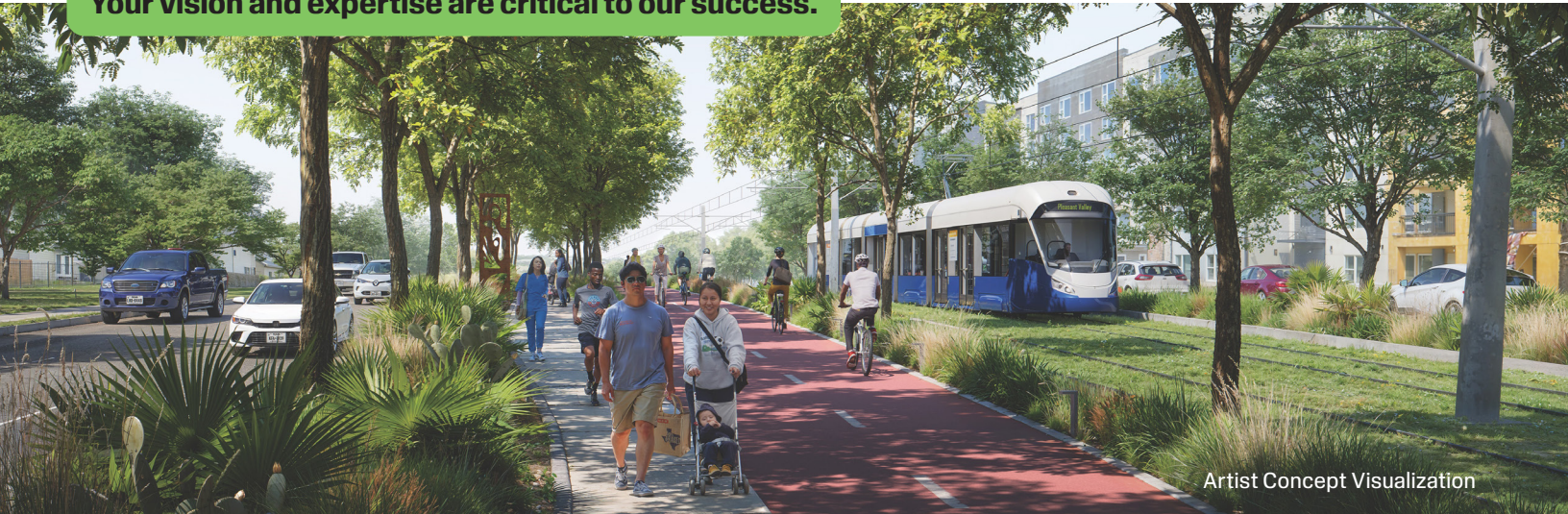
Artist Concept Visualization

Your vision and expertise are critical to our success.