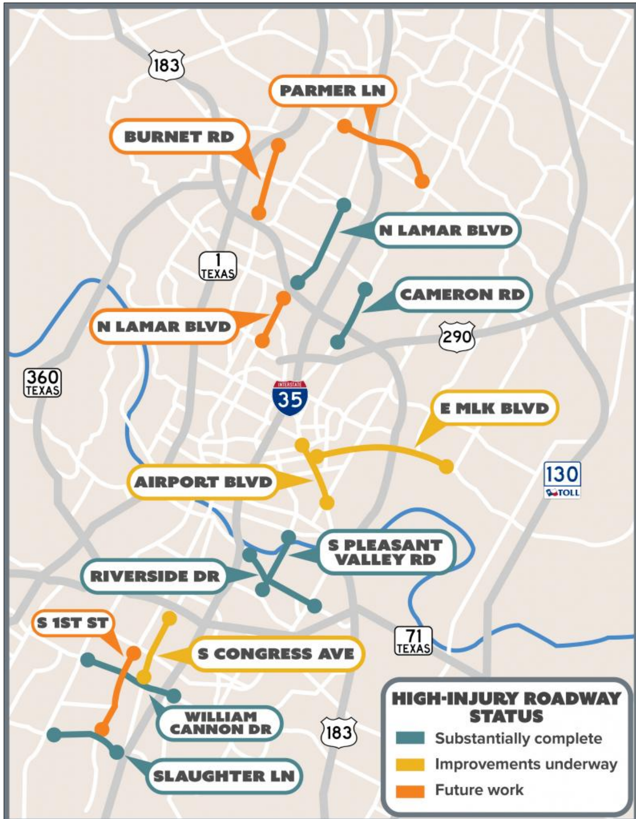
Figure 2: High-Injury Roadway Improvements