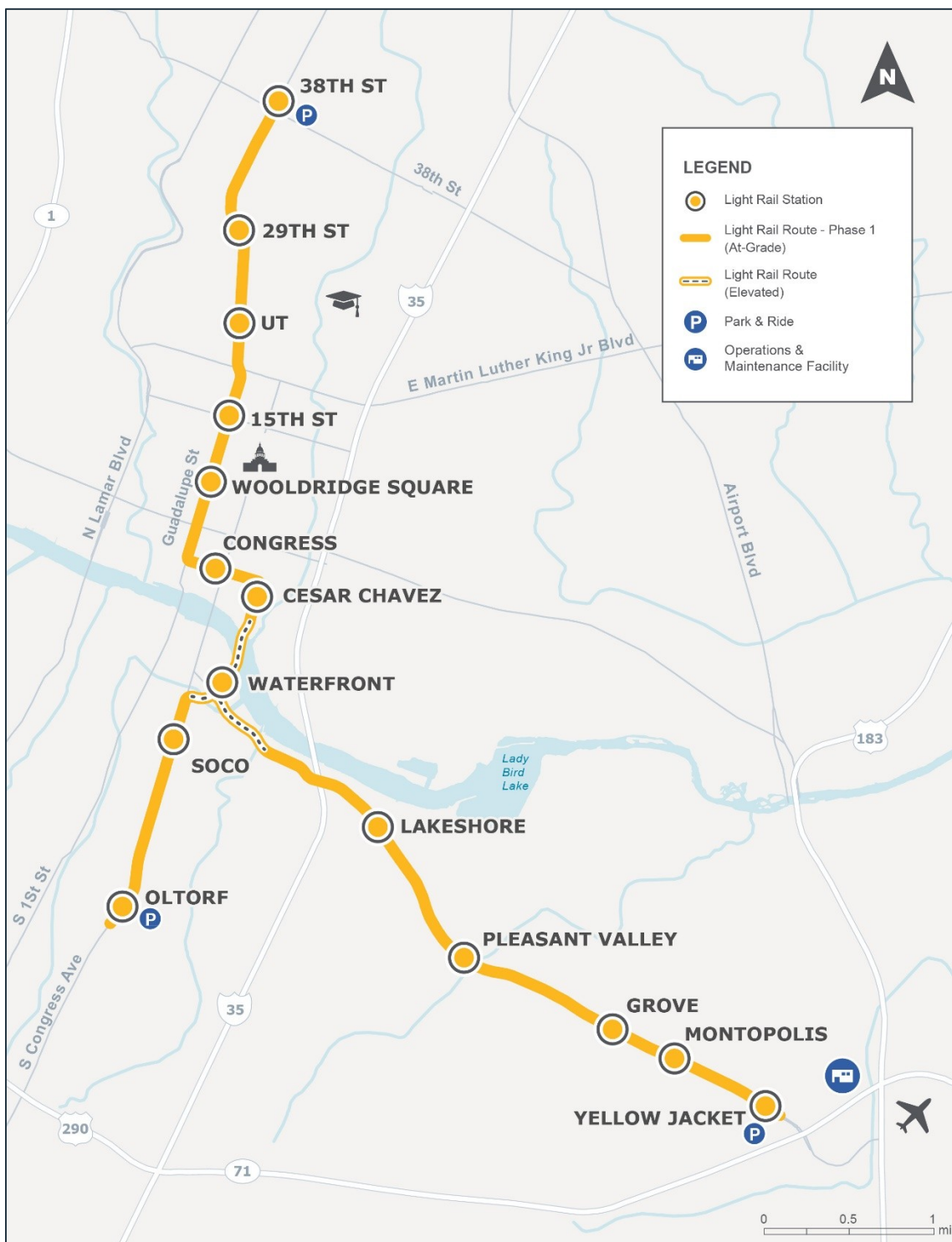
Figure 1. Project Location Map